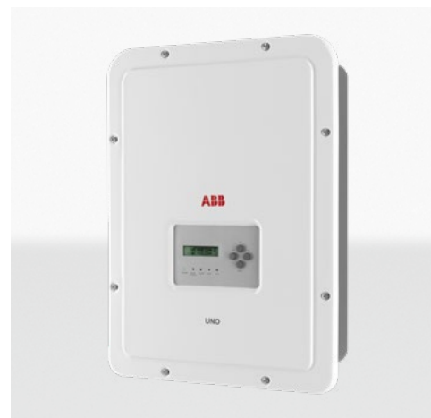
ABB string inverters UNO-DM-3.3/4.0/4.6/5.0-TL-PLUS 3.3 to 5.0 kW