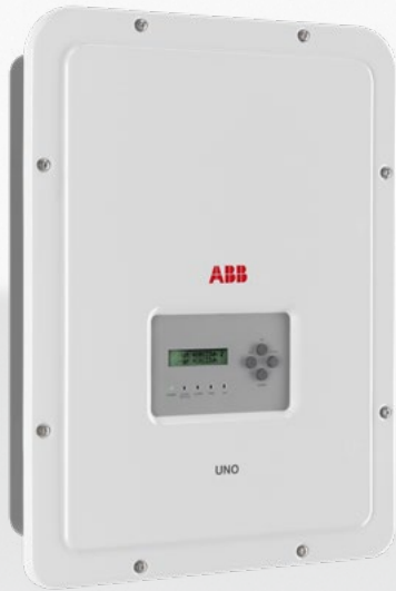
UNO-DM-3.3/4.0/4.6/5.0-TL-PLUS outdoor string inverter