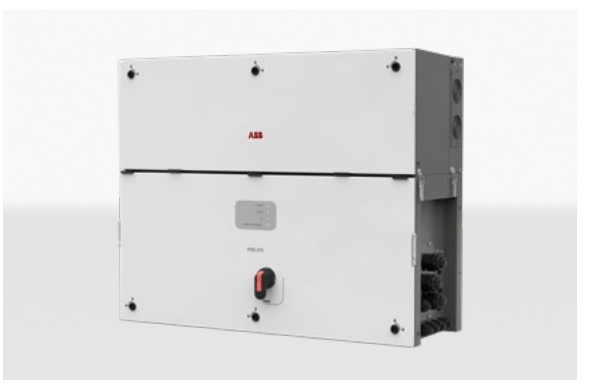
ABB string inverters PVS-175-TL *Preliminary