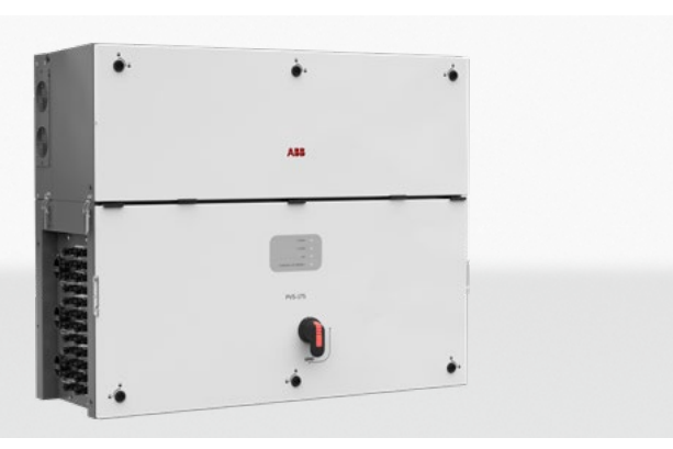
ABB string inverters PVS-175-TL *Preliminary

The PVS-175-TL is ABB's innovative three-phase string inverter, delivering a six-in-one solution to enhance and optimize solar power generation for ground mounted utility scale applications.